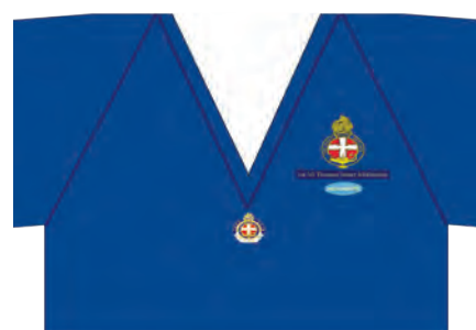
With 125th Anniversary Badge