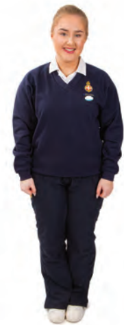
Associate Working Uniform