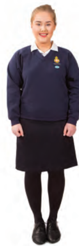
Associate Ceremonial Uniform